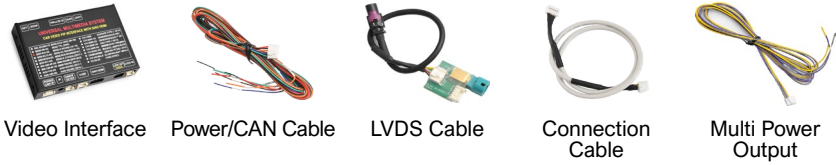
Video Interface Power/CAN Cable LVDS Cable Connection Cable Multi Power Output